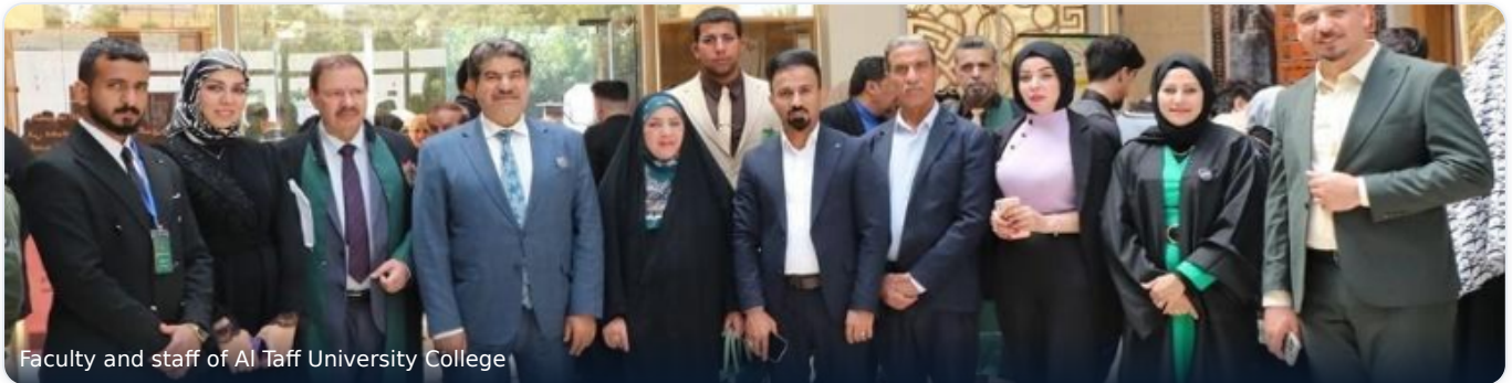
Faculty and staff of Al Taff University College

Six departments confirmed from the College's official records (Medical Physics and Law added by 2024).