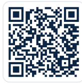
Environment & operations