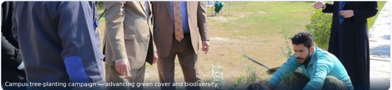
Campus tree-planting campaign — advancing green cover and biodiversity

On-campus Medical Unit: first aid and routine screenings, with preventative health campaigns.